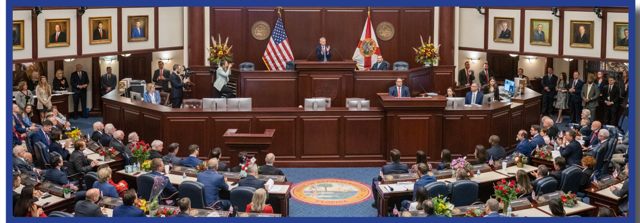
2022 Organization Session

FellowsProgram@MyFloridaHouse.Gov MyFloridaHouse.Gov/Fellows